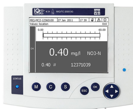
IQ SensorNet 2020 3G controller displaying NO x sensor measurements

The single-wavelength and spectral sensors both provide benefits, so which is best for your application? The single-wavelength sensors can provide trending for organics or NO x at a moderate price, and there are even applications which specifically utilize single-wavelengths sensors, such as UVT-254 for UV disinfection. However, the spectral sensors are calibrated to specific applications (influent, secondary treatment, effluent) and because they scan 256 wavelengths, they provide higher accuracy, higher repeatability, and better correction for turbidity than single wavelength sensors.