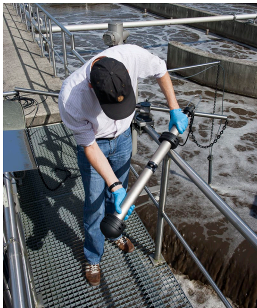
Figure 4. UV Vis sensors are low maintenance.

This system uses an air compressor to periodically force pressurized air over the optical windows, removing any solids that could disrupt the measurement. The YSI air blast system links directly to the sensor and is programmable within the controller to clean at a desired interval. Both automatic cleaning systems are capable of keeping sensors reading accurately for several weeks within wastewater applications.